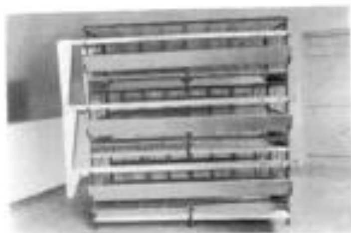
DRIE DEKKER STANDAARD LEKOR

ONTWIKP VIR WETenskaplike WYSGEWENDE PLUIMVEEBOUERS