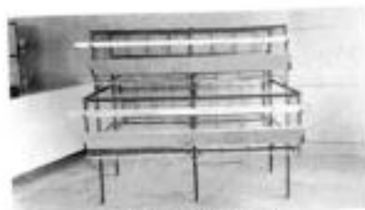
STANDE PIRAMIED LEKOR