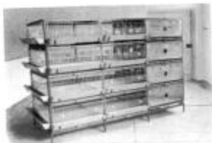
VEER DEKKER BATTERYKLEINNSDEKER