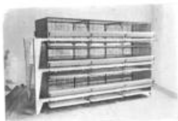
DRIE DEKKER VERMAAKDOEK VIR BROEIERKLEINNS